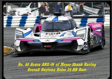
No. 60 Acura ARX-06 of Meyer Shank Racing Overall Daytona Rolex 24 Hr Race