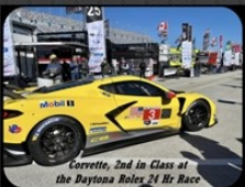
Corvette, 2nd in Class at the Daytona Rolex 24 Hr Race